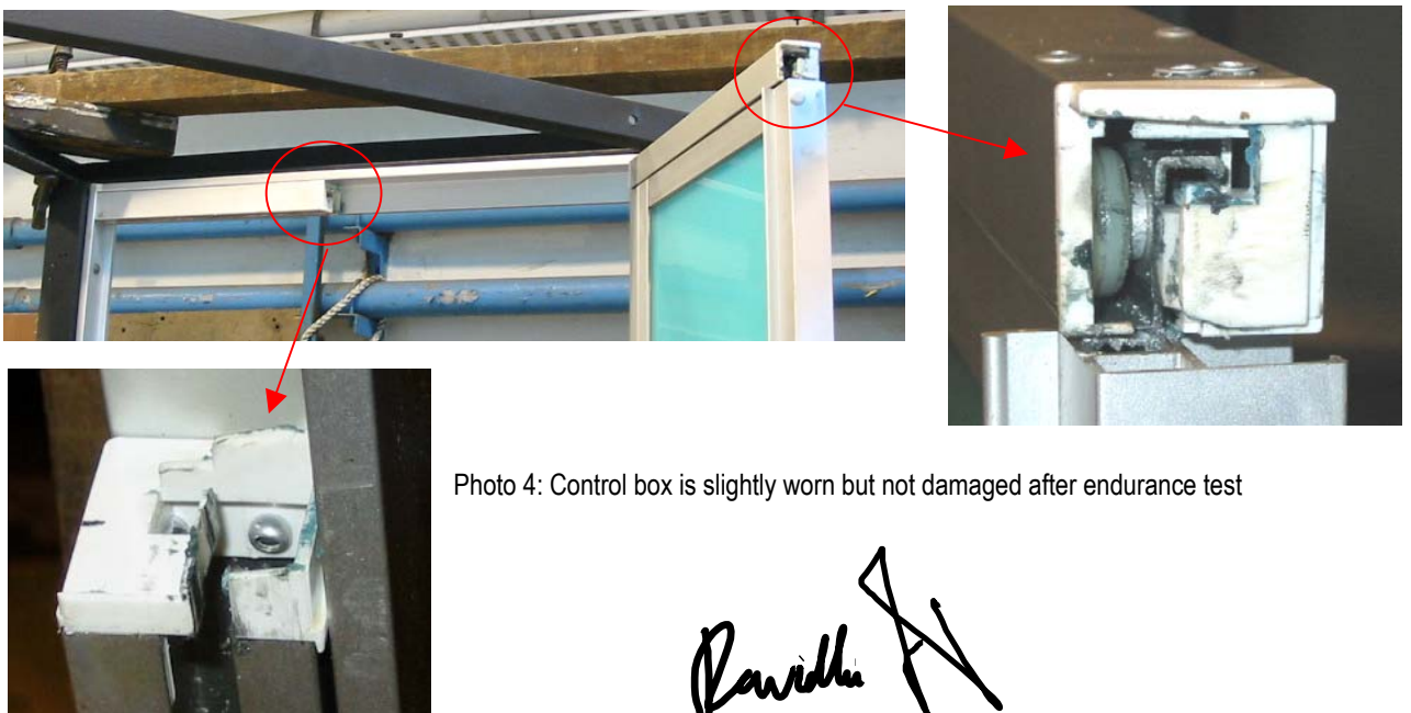
Photo 4: Control box is slightly worn but not damaged after endurance test